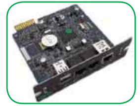
AP9631: Management Card