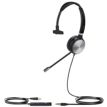
UH36 Mono Teams UH36 Mono UC

Deeply integrated with Yealink IP phones that the advanced features, such as volume synchronization and multiple calls control, are just right at your fingertips.