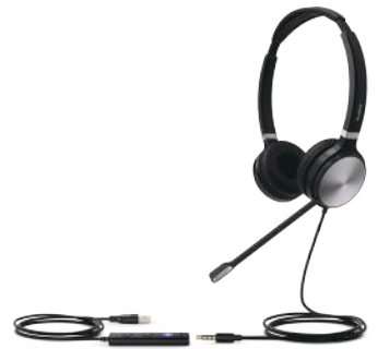
UH36 Dual Teams UH36 Dual UC