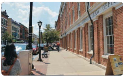
Safe and sound city