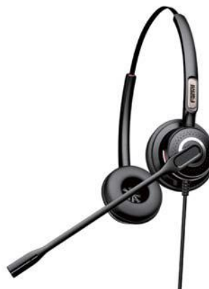
Fanvil - HT202