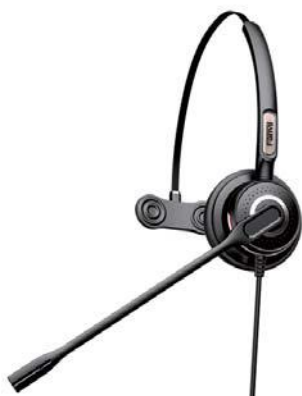
Fanvil - HT201

Fanvil HT201 & HT202 offer a range of premium quality headsets using Fanvil's innovative acoustic technology to deliver speech clarity and an excellent audio experience. Coupled with our sleek design that focuses on comfort and durability, the Fanvil HT201 & HT202 headset offers a new level of experience for call center professionals.