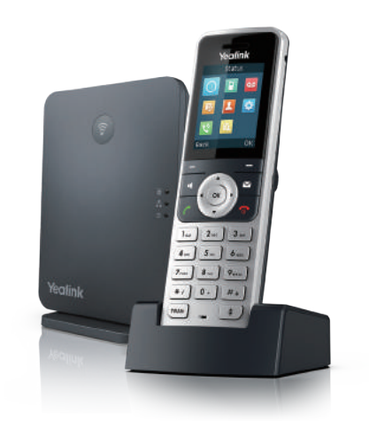
*The W53H is perfect to use with the W53P